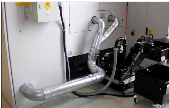
Connection ductwork to machine tool

The treatment of graphite materials in metalworking processes generates fine dust inside the work area. This dust can permeate machinery, the workplace and the surrounding environment. High efficiency dust separation systems are required to prevent potential health risks and to adhere to regulatory guidelines in the management of graphite dust. Dust build-up concerns affecting the efficiency of machining processes and the safety of the machinery itself must also be addressed.