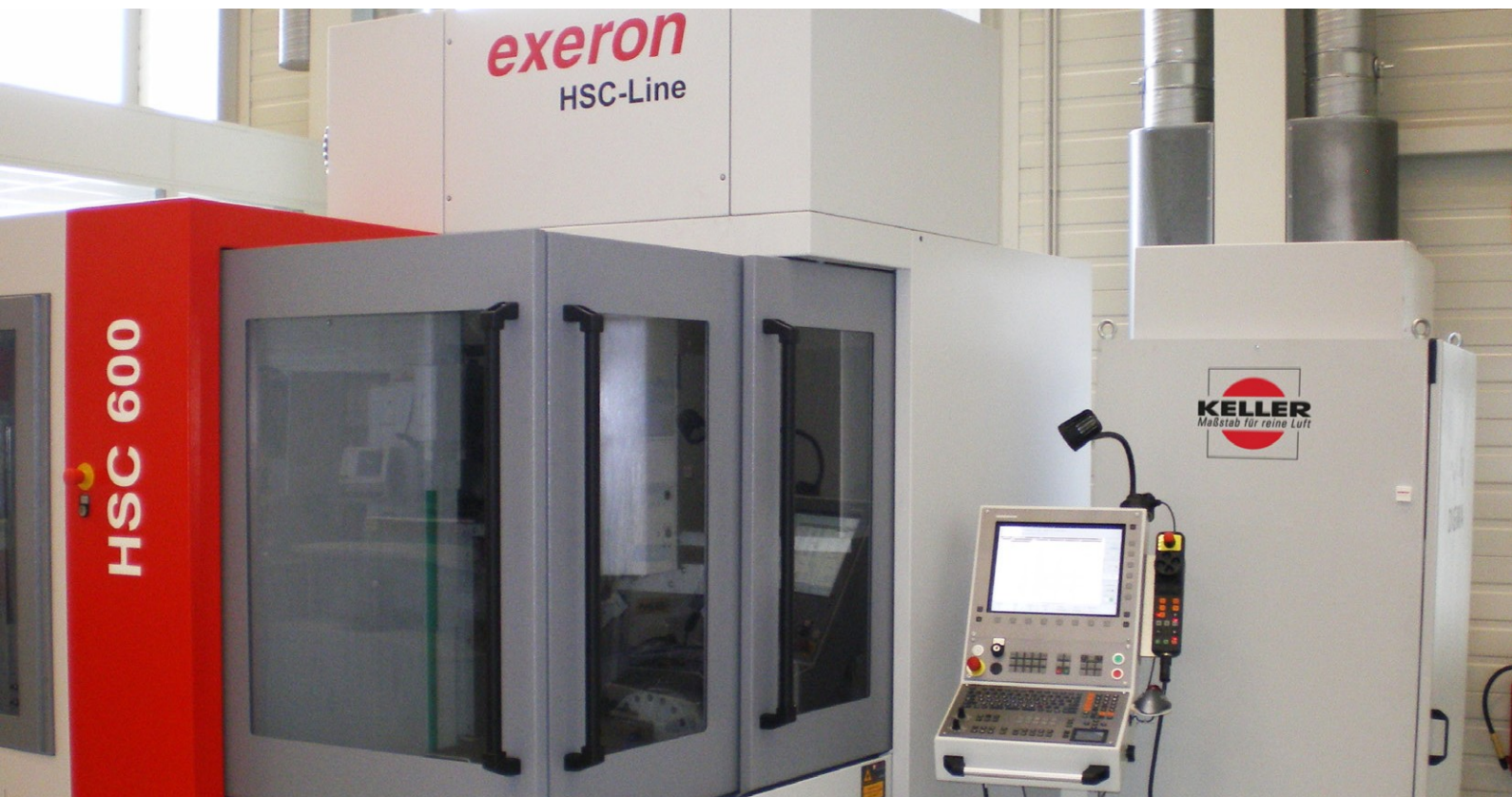
Extraction of a High-Speed-Cutting-Center with VARIO T 1.0 dry separator